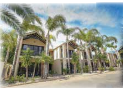
Door Prize Aquarius Apartments Mildura