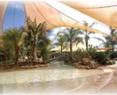
Teams Prize 6 Nights for 4 people at Sunraysia Resort