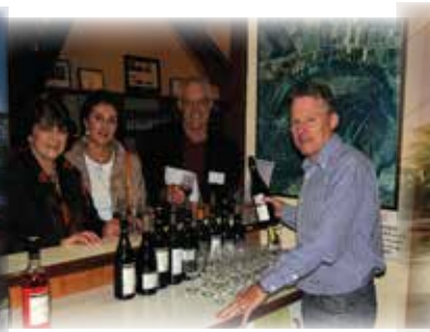
Trentham Estate Wine, 3 Course Meal & Music