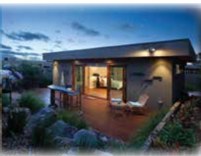
Door Prize McCrae Lighthouse Retreat