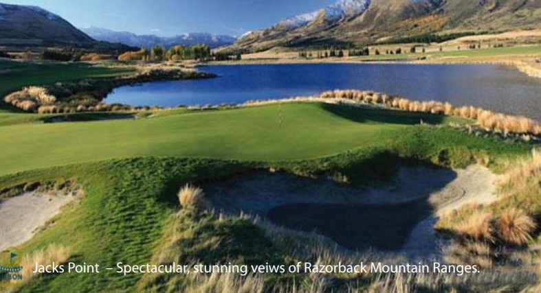
Jacks Point – Spectacular, stunning views of Razorback Mountain Ranges.