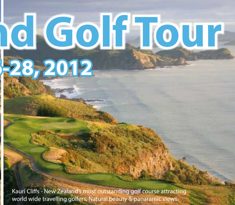
Kauri Cliffs - New Zealand's most outstanding golf course attracting world wide travelling golfers. Natural beauty & panoramic views.