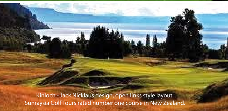
Kinloch - Jack Nicklaus design, open links style layout. Sunraysia Golf Tours rated number one course in New Zealand.