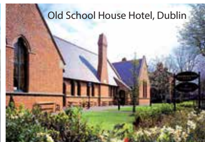
Old School House Hotel, Dublin