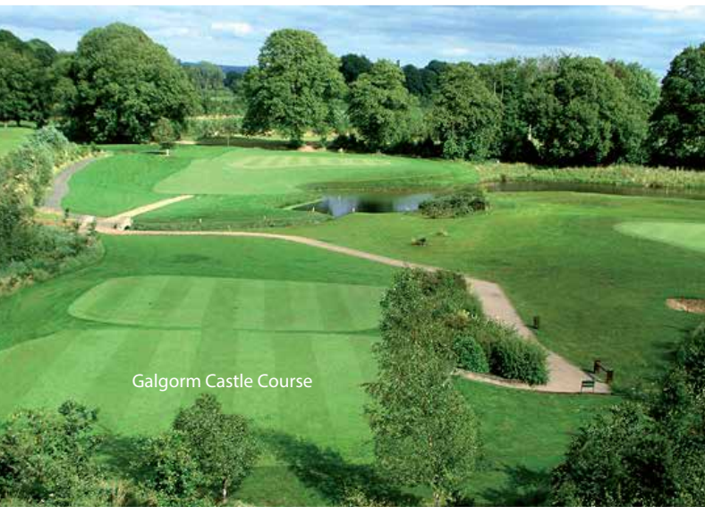
Galgorm Castle Course