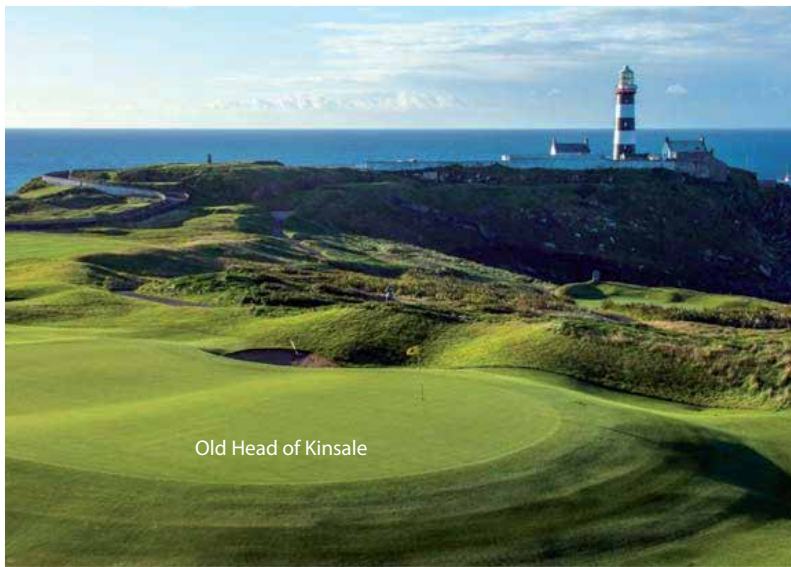
Old Head of Kinsale