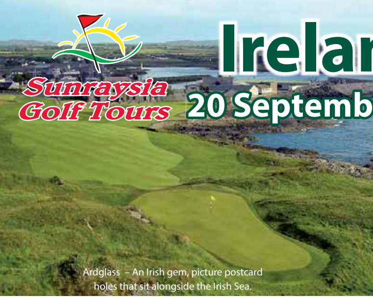
Ardglass – An Irish gem, picture postcard holes that sit alongside the Irish Sea.