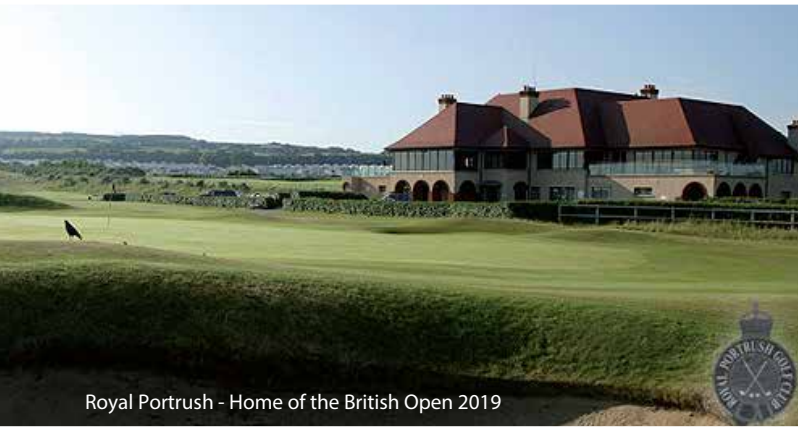
Royal Portrush - Home of the British Open 2019