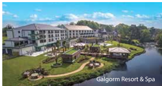
Galgorm Resort & Spa