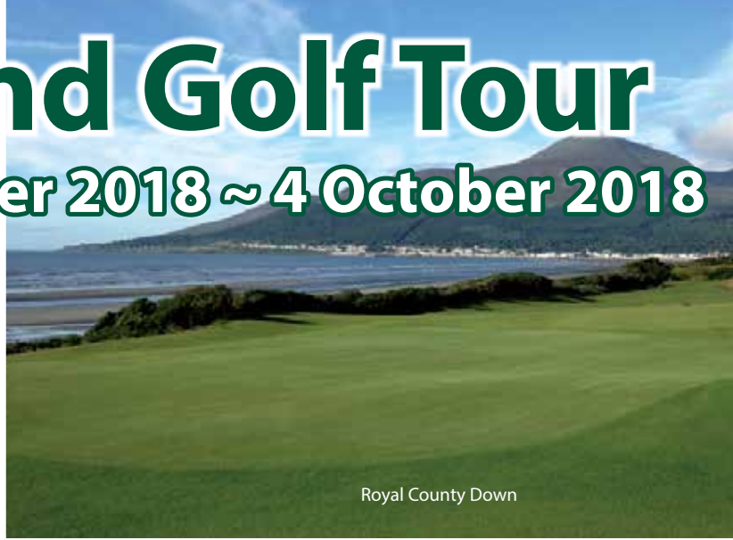
Royal County Down